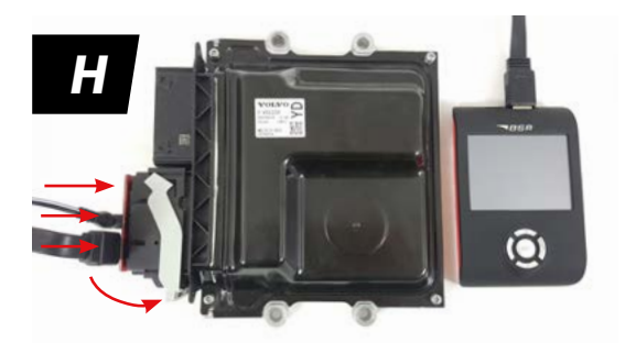
VCL connected for decoding.