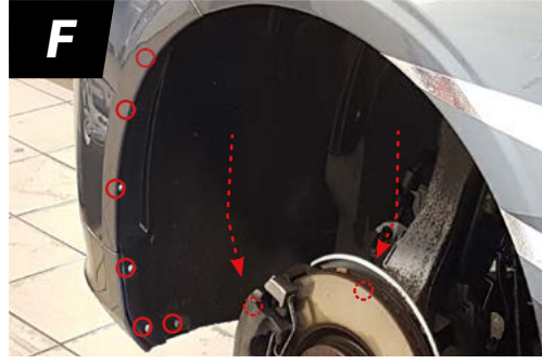
Screws holding the wheelhouse cover.