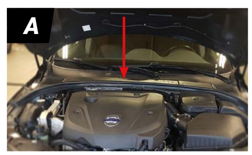
ECM located in the "aquarium" (V70, V60, S60 & XC60).