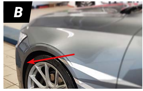
ECM in the wheelhouse (V90, S90, XC90 & V40)