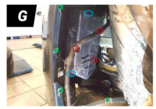
ECM box in wheelhouse.