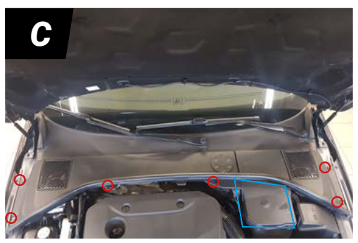
ECM removal, ECM in "aquarium".